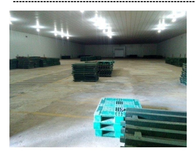
Photograph No. 02 - Veyangoda Warehouse No. 09