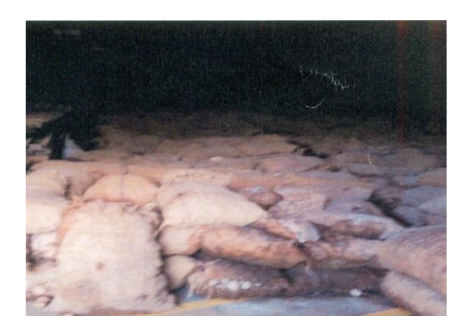
Photograph No. 03 - Veyangoda Warehouse No. 08