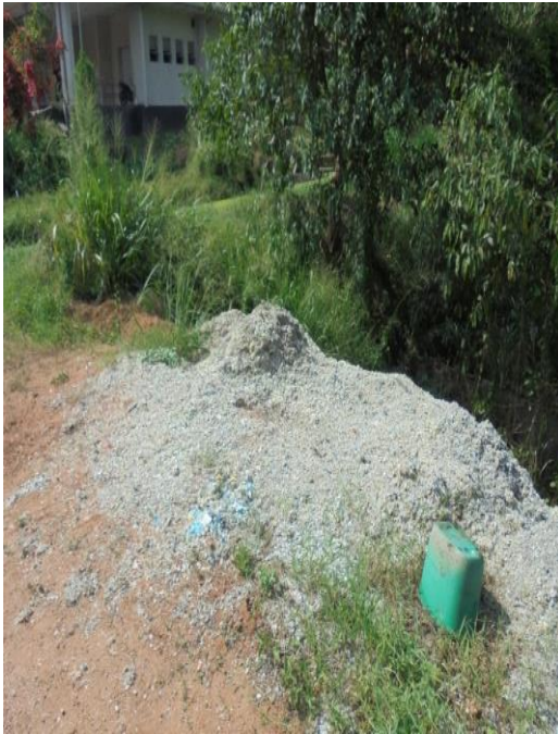
Photo- Disposal of Meta Mizer at Karawanella Base Hospital had been piled up on the hospital grounds due to not being taken away by the Municipal Council

Photo- Disposal from the Meta Mizer machine at the Kegalle Hospital had been dumped near a canal in the hospital premises