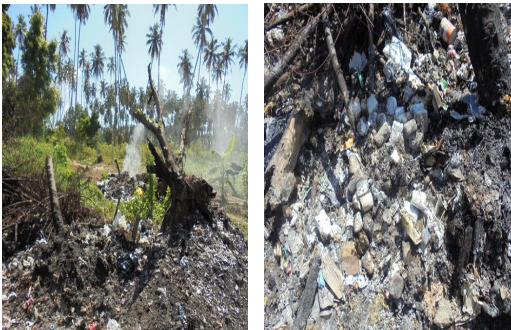
Photo - Clinical waste dumped at Marawila Base Hospital had been set on fire inside the hospital premises