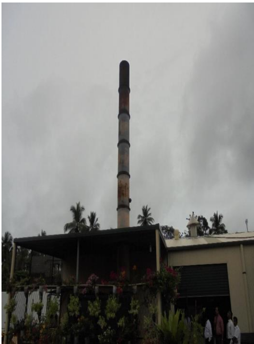
Photo- Steam coming out of the Meta Mizer machine at Ratnapura Hospital

Photo- Chimney of the incinerator of the Polonnaruwa Hospital remains at a low level.