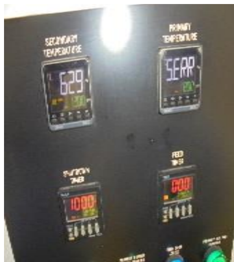
Photo: Temperature failing to reach the desired level during the burning process.