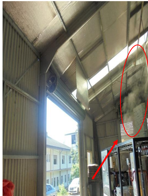
Photo- Steam coming out of the Meta Mizer machine at Kegalle Hospital