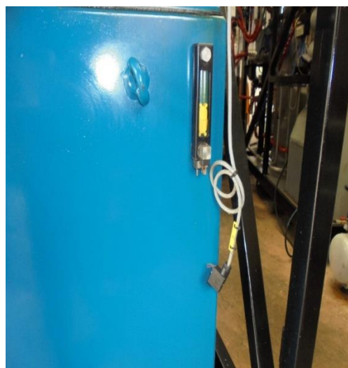
Photo : The hydraulic sensor of the Metamizer machine installed at the Chilaw Hospital remains disconnected.