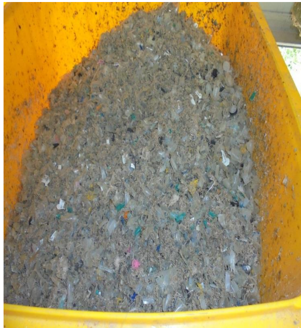
Photo : Presence of pieces of plastic in the remains of waste after being sterilized and treated by the Metamizer.

d) According to the technical specifications prepared for the Metamizer machines, a period of 20 minutes is taken for one cycle of sterilizing the clinical waste whilst 03 cycles would take place within an hour. Nevertheless, it was verified during the physical inspection carried out on the machines installed at the following hospitals that one cycle had taken approximately an hour to complete.