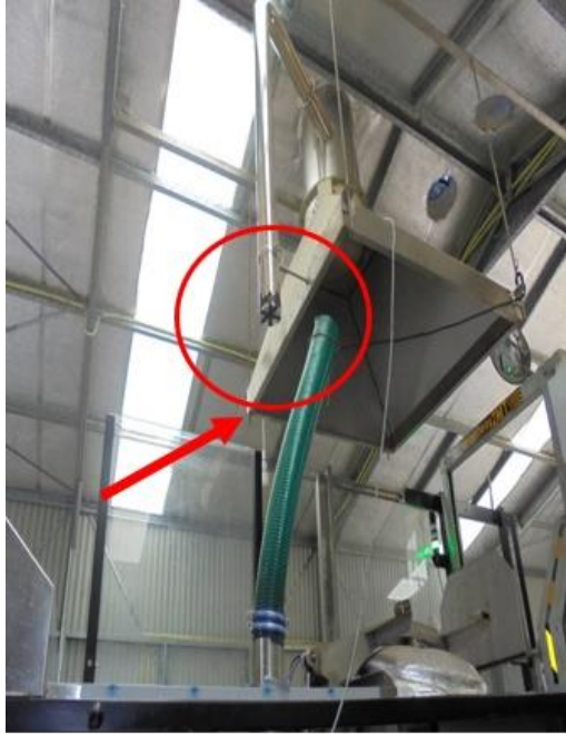
Photo: Vapour outlet of the Metamizer machine installed at the Marawila Hospital remains detached.