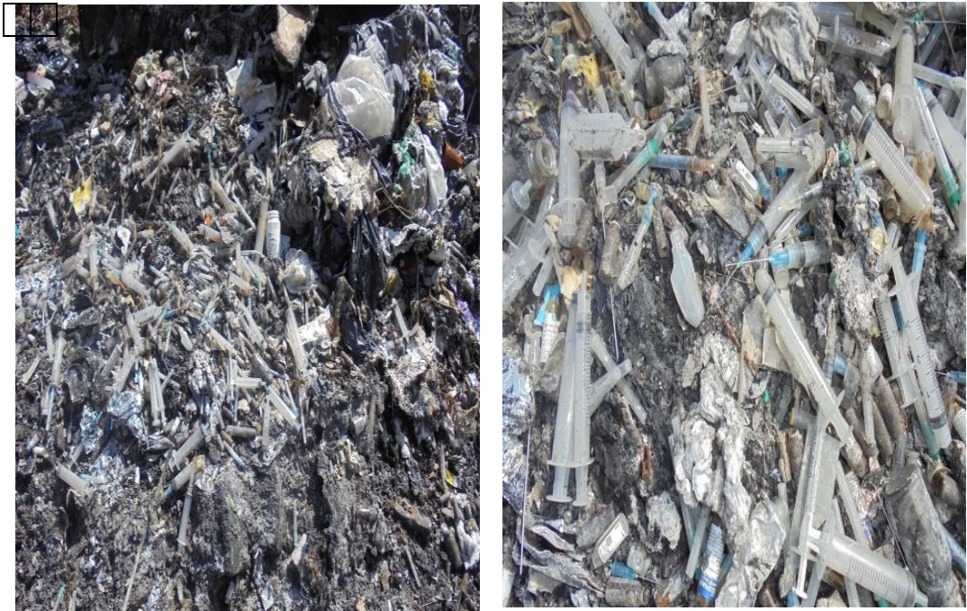
Photo: Sharp waste of the Marawila Base Hospital had been dumped in the hospital premises