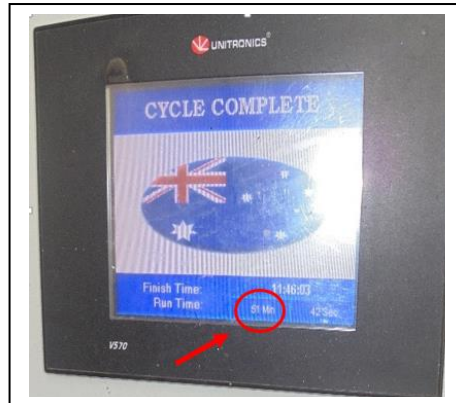
Photo : Time taken for the completion of one machine cycle at the Marawila Hospital.