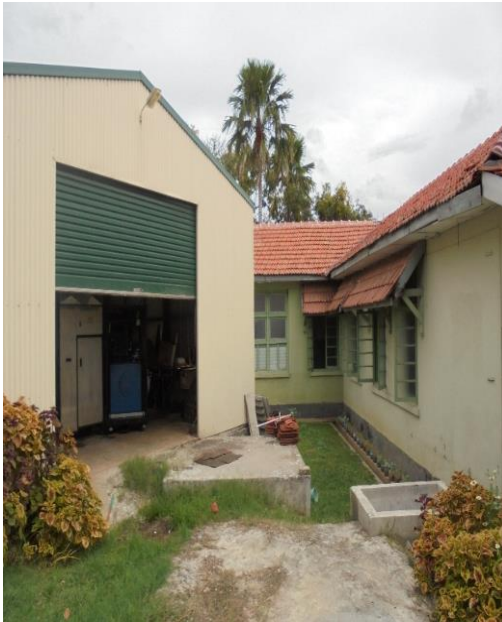
Photo- Waste Management Yard located near the wards of Chilaw Hospital.