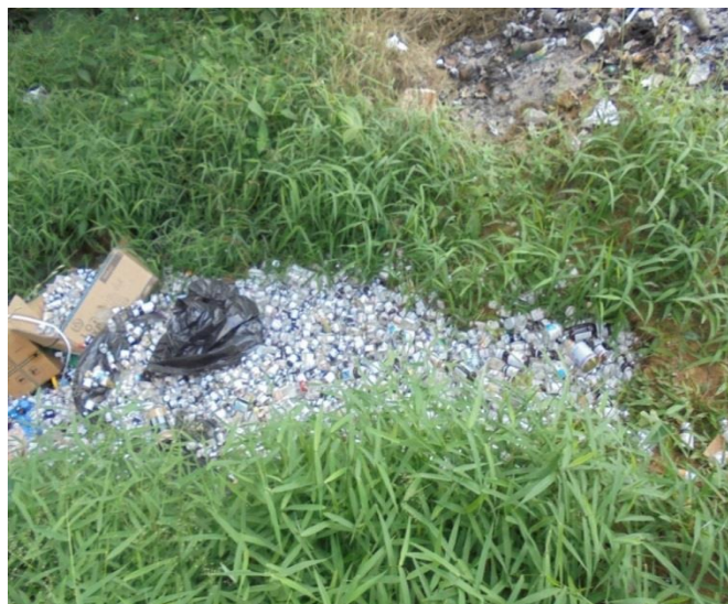
Photo- Em (Pvt) medicine phials released into the environment by Karawanella Hospital