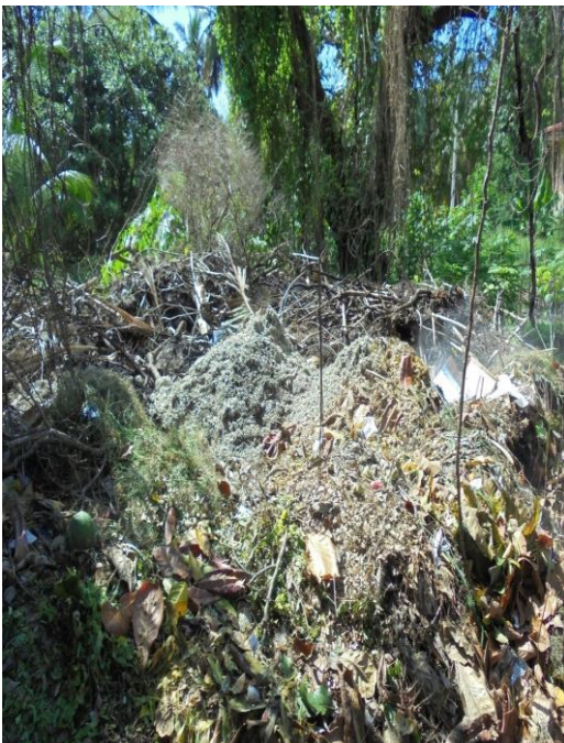
Photo - Waste treated by Meta Mizer machine at the Chilaw General Hospital has been piled up in the hospital premises

Photo - Waste removed from the Meta Mizer at Marawila Hospital being incinerated inside the hospital premises