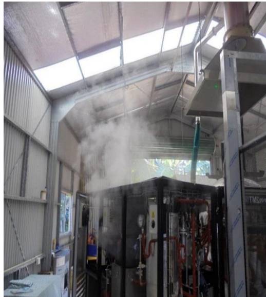
Photo : Water leaking from the Metamizer installed at the Embilipitiya Hospital.

Photo: Vapour emanating from the Metamizer installed at the Base Hospital of Kegalle.