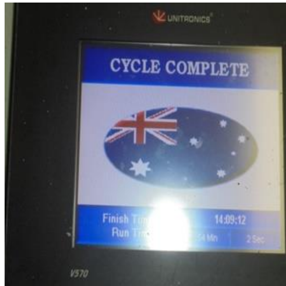
Photo : The Metamizer installed at the Polonnaruwa Hospital indicating 54 minutes for the completion of machine cycle at the physical inspection carried out by the Auditors on 02 December 2019 relating to the functionality of those machines.