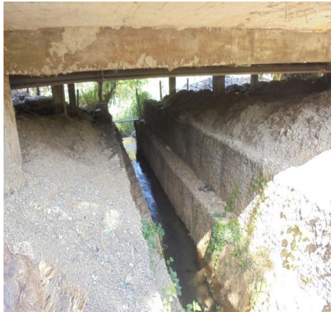
Photo - Waste discarded from Meta Mizer of the Kegalle Hospital remains dumped on both sides of the canal.