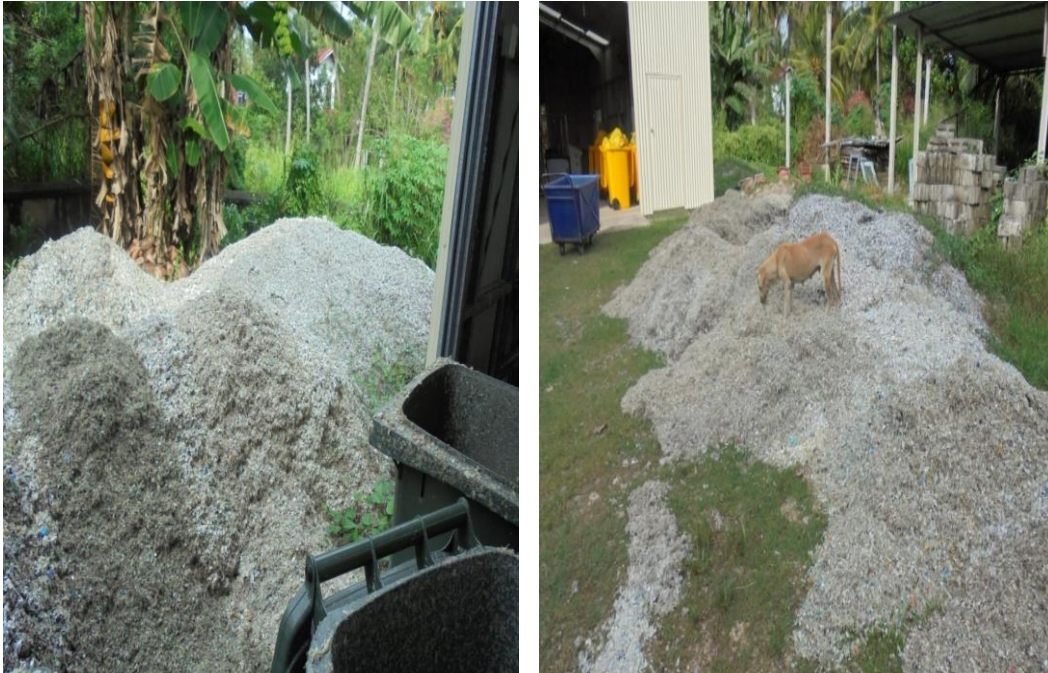
Photo: Treated waste piled up at Kuliypitiya Hospital