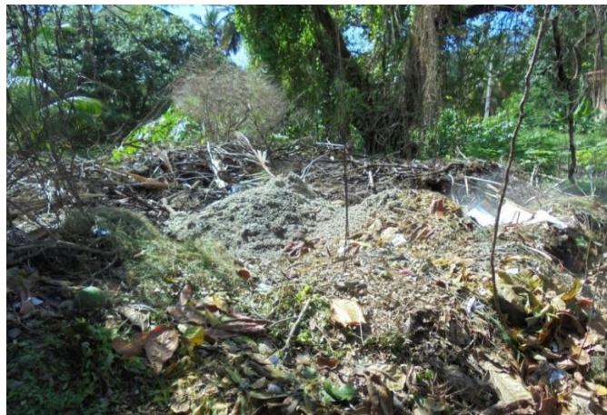
Photo- Incineration of waste released from the Meta Mizer within the hospital premises by the Marawila Hospital.